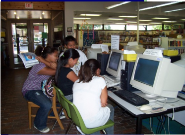
A collection of patrons doing a homework project

We are pleased to announce a new partnership with the Blair High FBLA club. In response to our patron requests, a series of technology workshops will take place beginning the 5th of October.