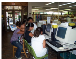
A Collection of students working on a project

There is our ever-popular educational toy collection. Parents, kids, teachers and grandparents use the toy library for entertain-